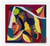
sonia louise davis

Peruvian highland wool, merino, recycled acrylic, 58 x 58 x 2 in.