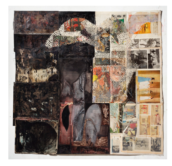
Ellen Gallagher, Hare, 2013. Ink, watercolor, oil, pencil and cut paper on paper. 44 4/5 × 46 3/5 in. Private Collection.