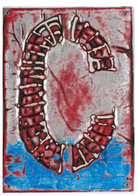
Mark Bradford, Untitled (A), 2001